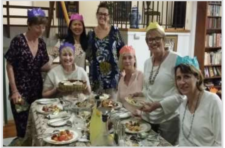
The ladies from the Journey Together Book and Reflection Group celebrated their last meeting for 2019 with a Christmas Feast.

May our waiting for the birth of the Lord in our hearts fill us this week with a sense of joy and gratitude!